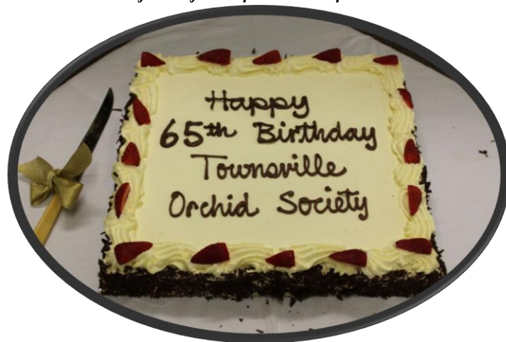
The Oldest (Les Kennedy) & Youngest (Isabella Lucke) cut the celebratory cake